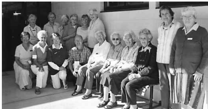
Members of the Marian Group