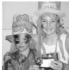
St Patrick's Celebration, Kaiapoi

The event was well attended with around 150 parishioners and families attending. Of course, Irish songs were obligatory really. The Parish music group provided a musical backdrop for the repertoire of Irish songs to sing along to and printed up a song book so that anybody willing to sing had the words available. We had an Irish Dancing demonstration and those