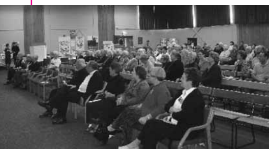
Welfare Day Crowd

Organisations were varied and included Armstrong Village, Catholic Maori Youth, Catholic Social Services, Catholic Women's League, Catholics on Air, Mercy Sisters, Parish to Parish Accommodation, Tertiary Chaplaincy, St Vincent de Paul Society, Korean Parish and Mercy Library.