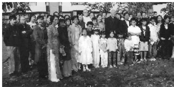
Vietnamese Catholic Community