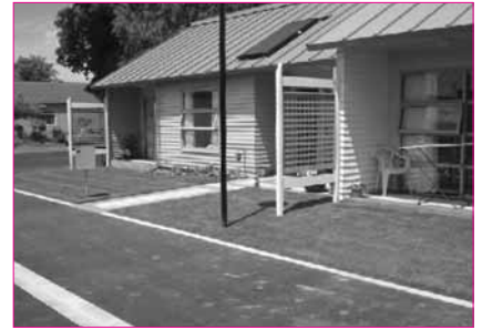
New Mary Potter Villas